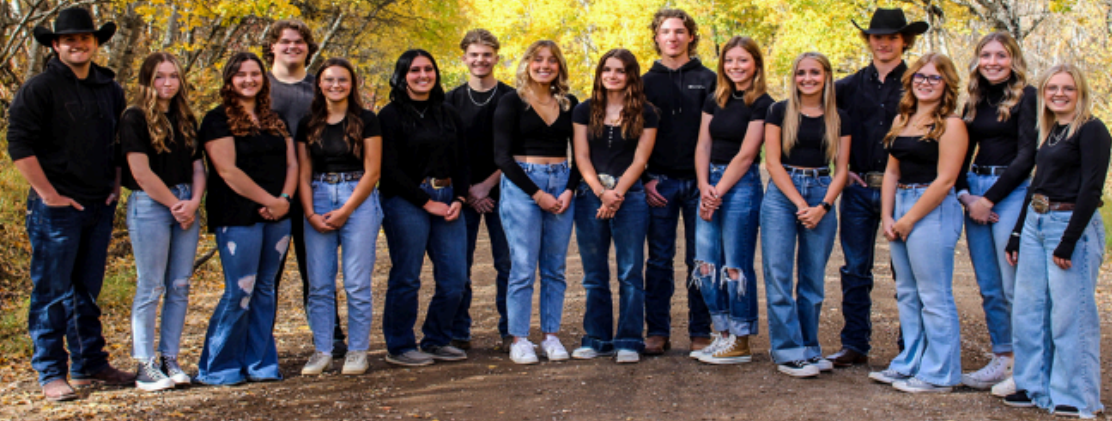
Exercises at 7:00pm, School Gym