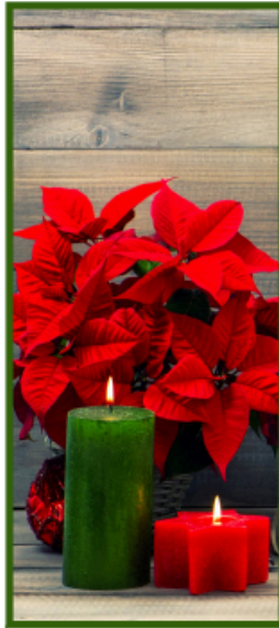
Approximate Poinsettia Sizes: 6.5" pot 14 to 16" tall and 13 to 16" wide