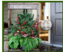
Approximate Greenery Arrangement Size

Hanging Greenery Bough Greenery that is versatile! A fun, vintage burlap bag holds premium greens and red ilex berry branches. Completing the look are holiday picks like a bow and a pinecone. Lean it up against stairs, benches or your home and hang from your door.