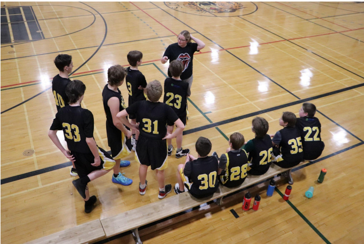
JR BOYS AND JR GIRLS BASKETBALL IS IN FULL SWING IN FEBRUARY. GO WILDCATS!